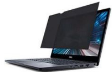
DELL PRIVACY FILTER 14"

The perfect security companion for your Dell laptop. Able to withstand up to 150 pounds of force, the patented peripheral cable trap allows you to secure your power cables or other peripheral devices.