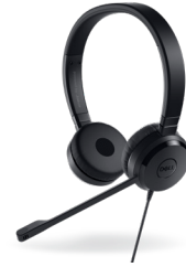
DELL PRO STEREO HEADSET | UC350

With a compact mouse and full-sized keyboard for accurate typing, this keyboard mouse combo offers the convenience of wireless and clutter-free performance.