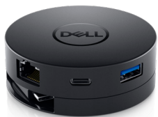
DELL USB-C MOBILE ADAPTER | DA300

Connect your Wyse to almost any device with a convenient 6-in-1 compact adapter and collaborate from any location.