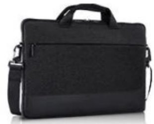
DELL PRO SLEEVE 14"

This lightweight and compact power bank will allow your mobile thin client or cellphone to stay powered on-the-go without adding bulk to your bag.