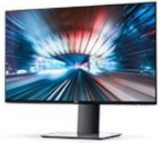
DELL 24 MONITOR | P2419H

Optimize your workspace with this efficient 23.8" monitor built with an ultrathin bezel, a small footprint and comfort-enhancing features.