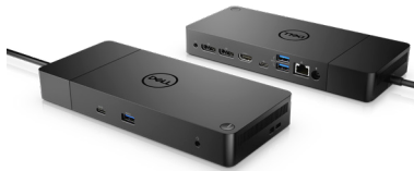
DELL DOCK | WD19

Work at full speed with Dell's powerful USB-C dock. Charge your system faster, support up to three displays and connect to your peripherals via a single cable.